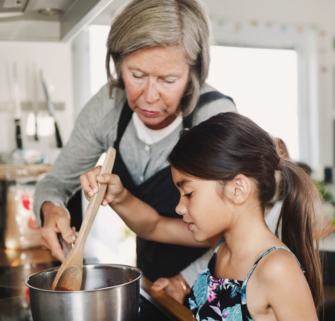
Detach and keep in a handy place.

Get 24/7 support from dedicated nurses who specialize in the care of complex conditions